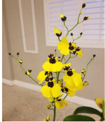
Betty's Onc. Moon Shadow 'Tigertail' (above) is in sphagnum moss. She did not repot when purchased, but will repot in additional sphagnum, not disturbing roots. It was blooming in May, then again 6 months later with a longer spike. Grown outside receiving a lot of rainwater.