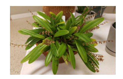
Stelis argentata 'The Silvery Stelis' Okay, maybe it is kind of cute.