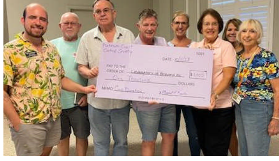
The Board presented our check to Candlelighters of Brevard.